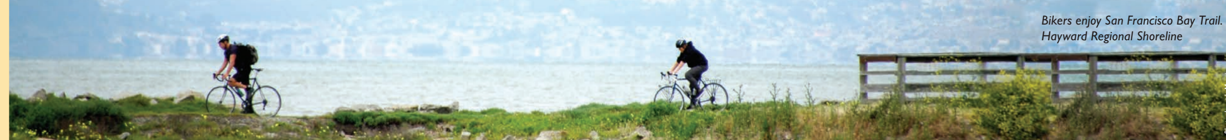
Bikers enjoy San Francisco Bay Trail, Hayward Regional Shoreline

Endangered burrowing owl. McLaughlin Eastshore State Park, Berkeley